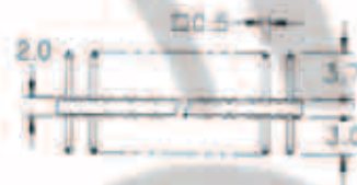
197 SERIES: RIGHT ANGLE